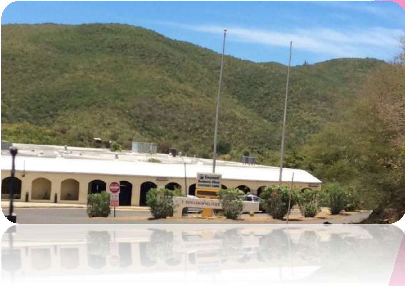
Emanuel Benjamin Oliver Elementary School - STT